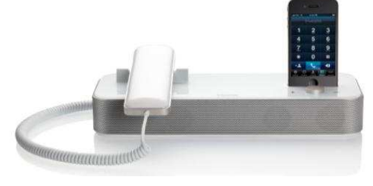
Smart Office Phone by invoxia: Smart IP desktop and conference phone.