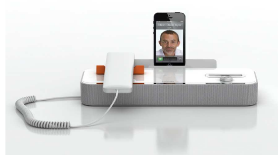
AudiOffice by invoxia