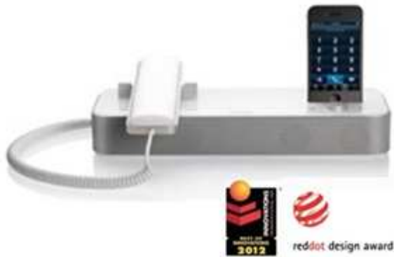
Smart Office Phone by invoxia: Smart IP desktop and conference phone.

Invoxia's current product range compatible with all IOS devices, PC, tablets, smartphones, including iPhone5: